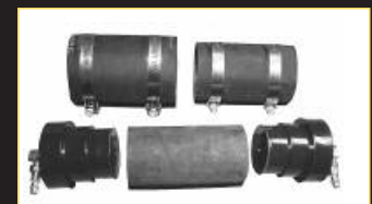
HEAVY DUTY ADAPTERS (OPTIONAL) Part No. 200-8803