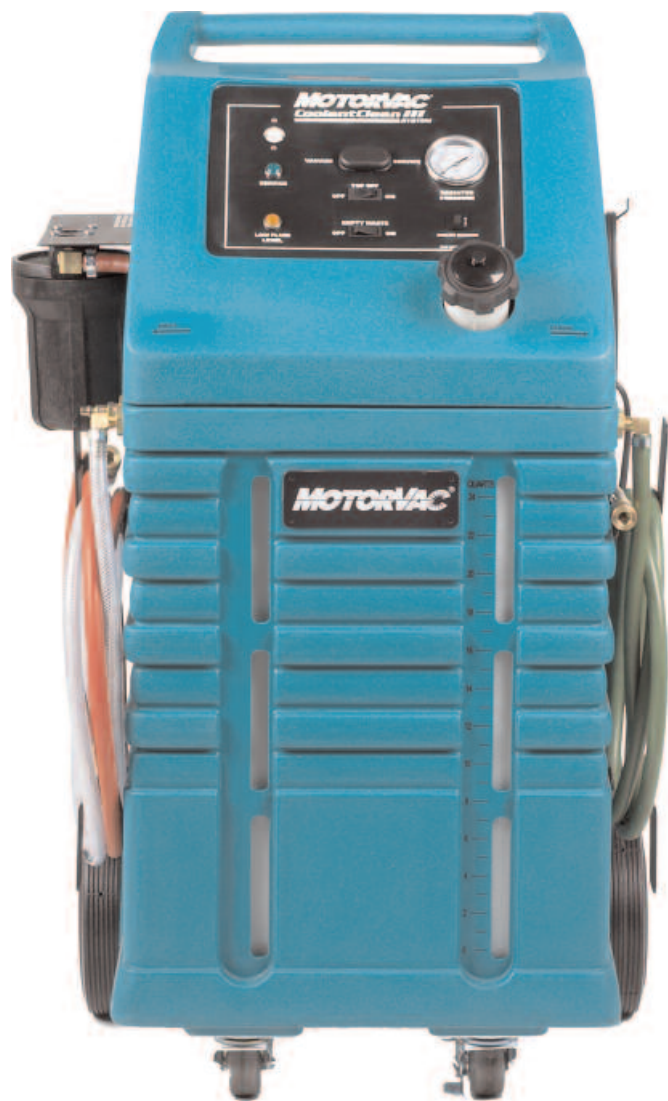
Part No. 500-5100P

The CoolantClean Service Kit is specifically formulated to be used with the CoolantClean System!