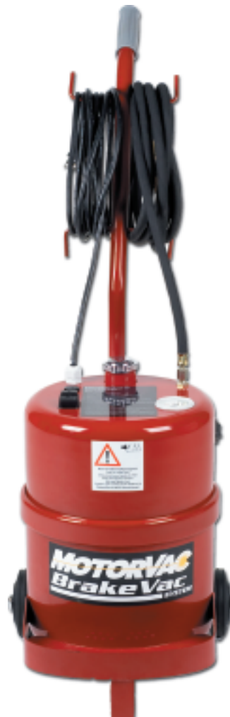
Part No. 500-8050