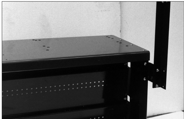
Figure 2 – Attach Uprights to Brackets