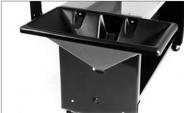
Figure – Attach Funnel