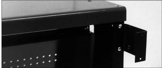
Figure – Attach Brackets to Cabinet