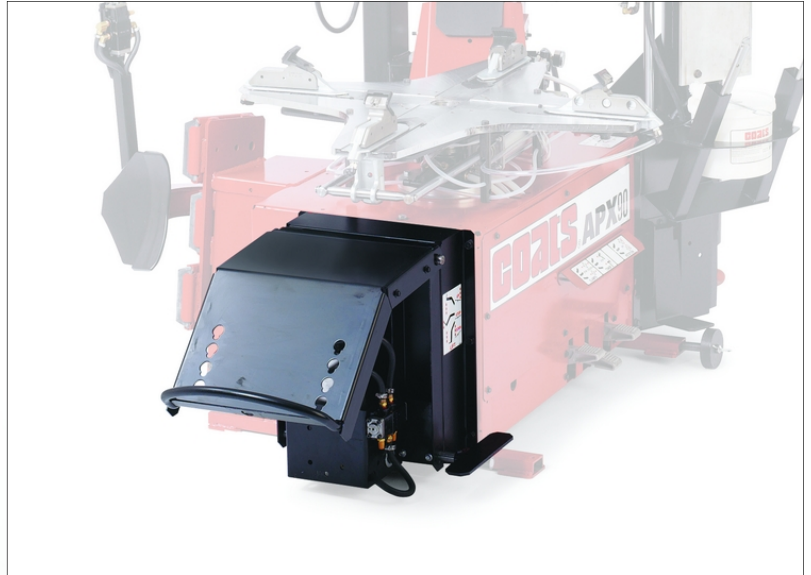
Wheel Lift System mounted on APX80

The Coats Wheel Lift System helps you get heavy tire and wheel assemblies up to tabletop height with minimal effort. It reduces operator fatigue and potential for expensive wheel damage.