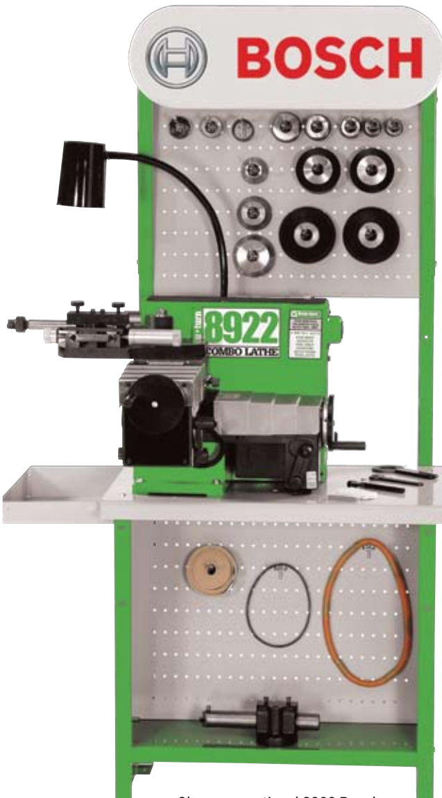
Shown on optional 8939 Bench with 8010 adapter group