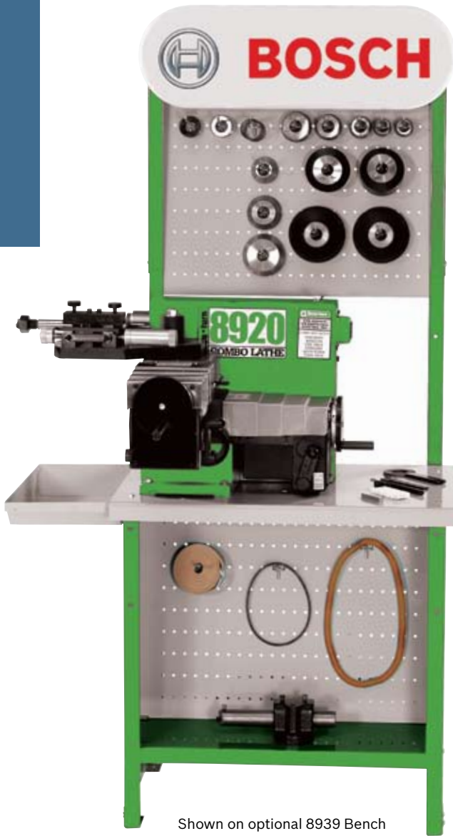
Shown on optional 8939 Bench with 8010 adapter group